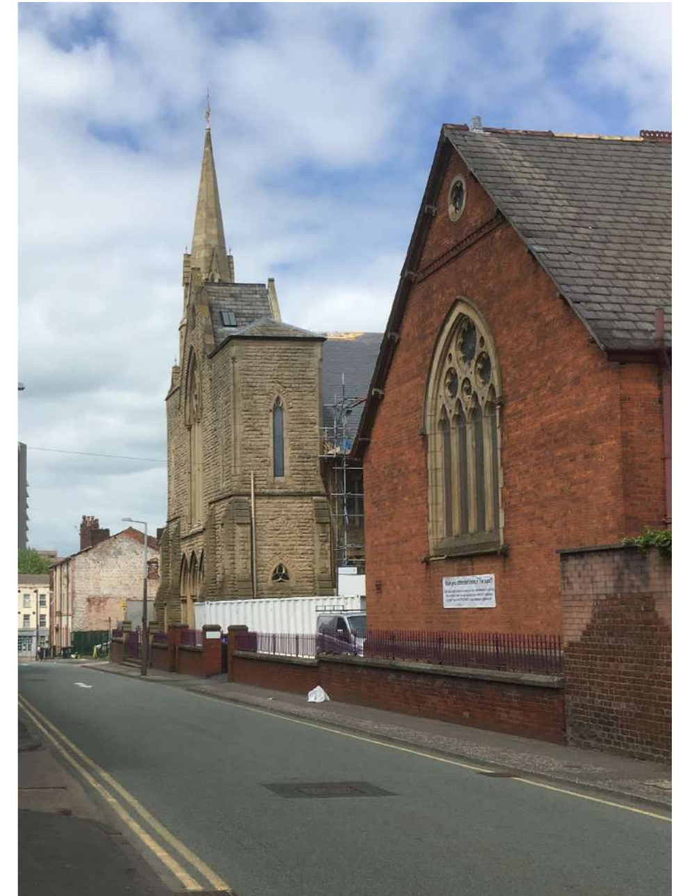
Image: Church on Grimshaw Street