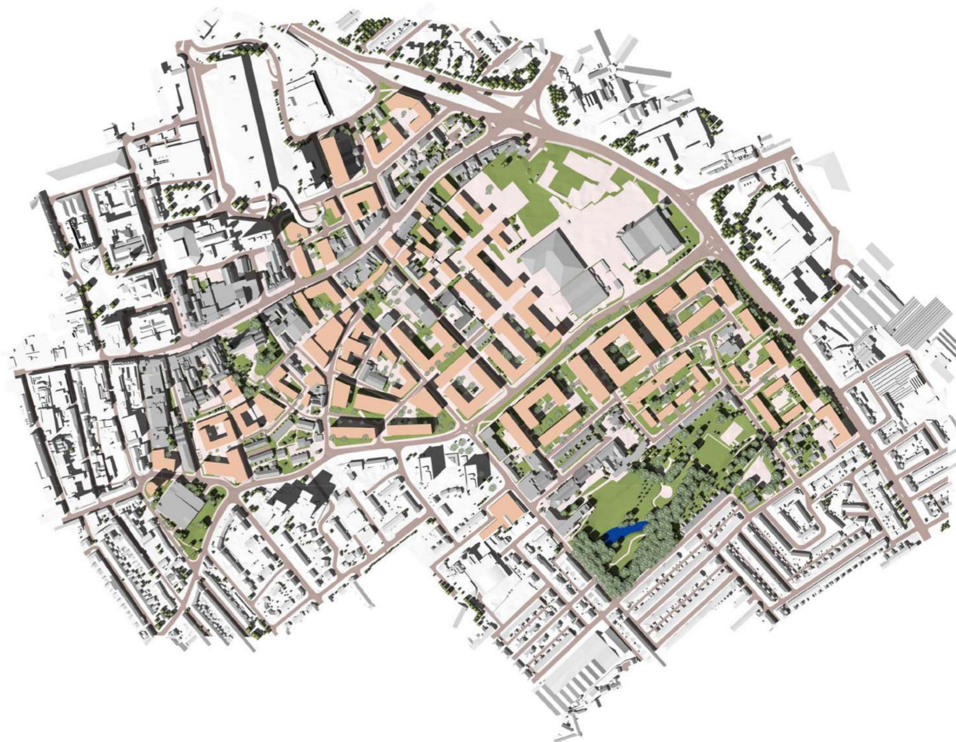
Figure 11: Illustrative Framework Masterplan

7.9 The strategy for 'lower' Church Street is to rediscover its mixed use commercial, retail and housing role, through a combination of an improved public realm, the protection of buildings of heritage value, the development of gap sites, the redevelopment of poor quality sites and frontages and the improvement of access for cars, at least for the short to medium term to support the early phases of development. Improvements to Church Street should be considered in the context of the proposals for housing on the former Horrocks Mill site, a potentially short term opportunity, and, in the medium to longer term, the radical redevelopment of the areas either side of Church Street at Church Row and the eastern corner of Church Street / Manchester Road. Improvements on Church Street should be timed to encourage and facilitate the development of the Horrocks Mill and the Blue Bell pub car parks sites which in turn will increase footfall and activity in this area to the benefit of other regeneration projects.