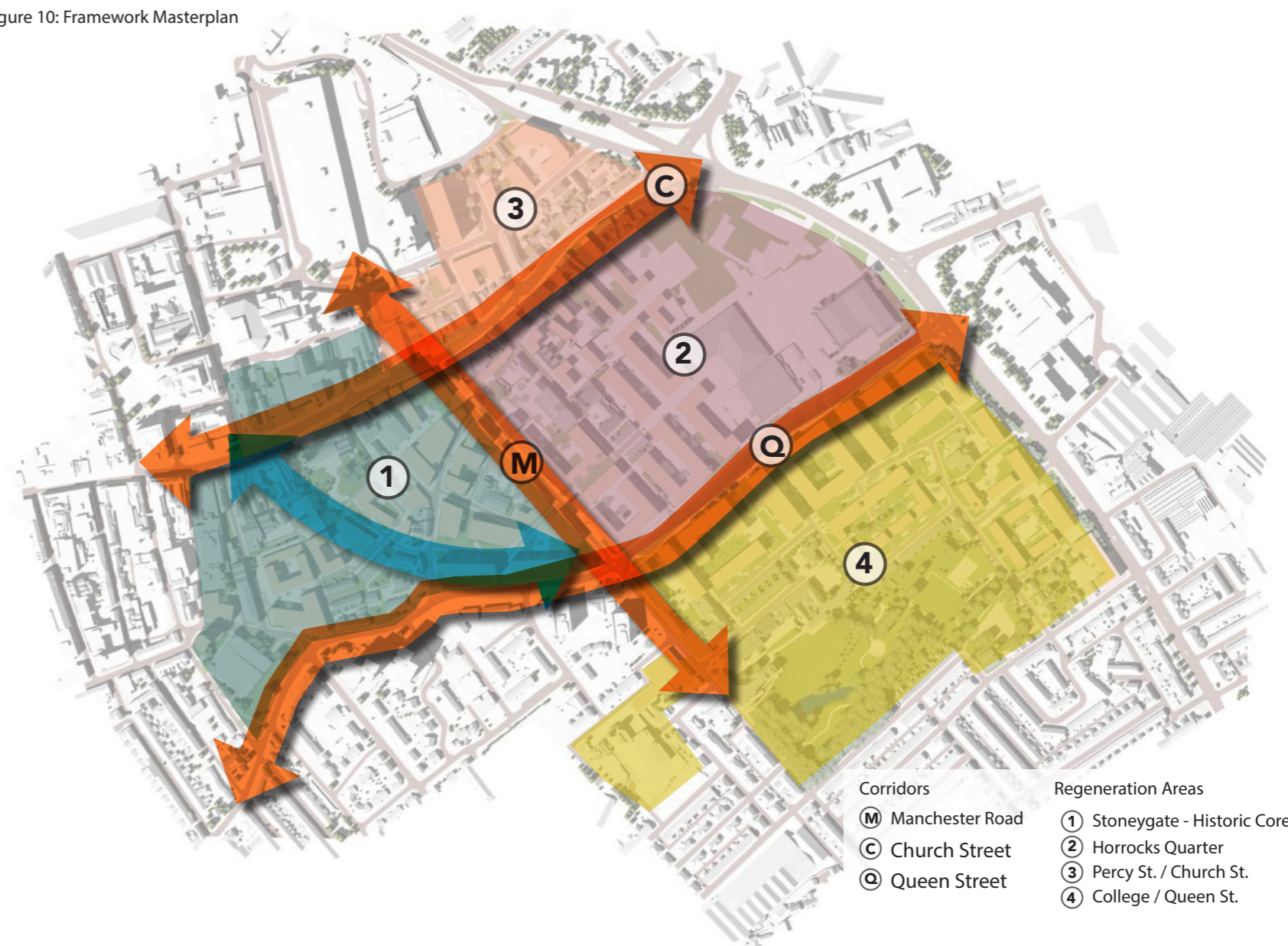
Figure 10: Framework Masterplan