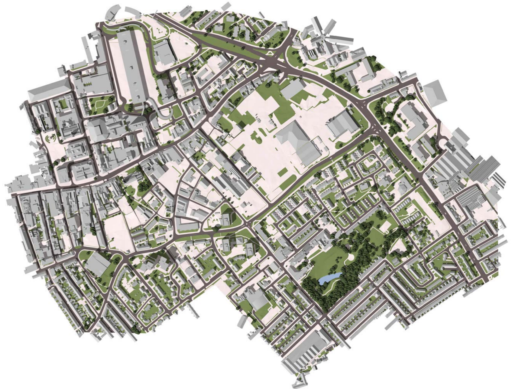
Illustrative Masterplan Framework

Stoneygate 'Urban Village' therefore has significant potential. However, it will be important to create the conditions where the market can develop to realise this Vision. The public sector will have a key role to play in this respect, through promoting the area, facilitating the private sector, encouraging enterprise and importantly, through investing in infrastructure and the public realm. It will also be important to work closely with the key existing stakeholders that will be instrumental in bringing forward change.