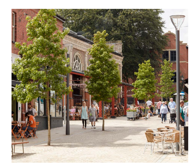
Pedestrian priority street with clear definition of uses through materials and furniture.